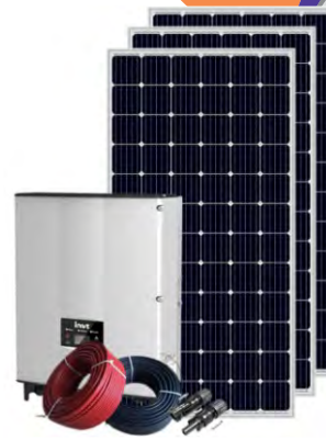
On Grid Solar System