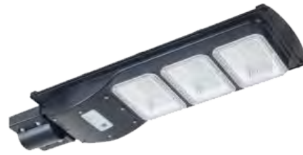
LED Solar Lamp