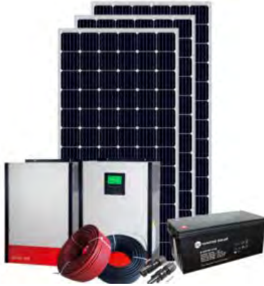
Hybrid Solar System