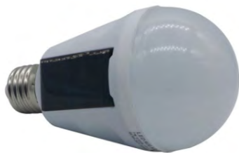
Solar Light Bulb