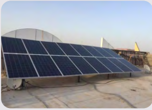
Afghanistan-5kw Hybrid System