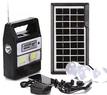
Portable Solar System