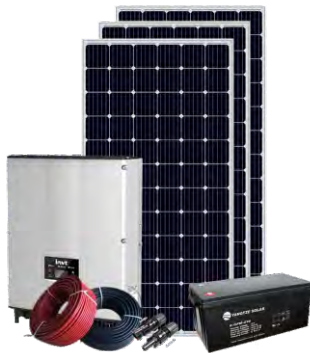
Off Grid Solar System